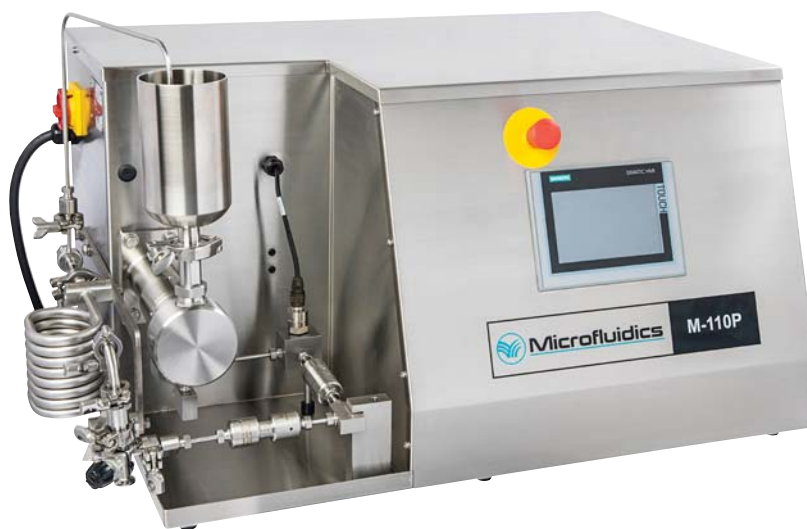
Model shown is subject to change depending on options selected.