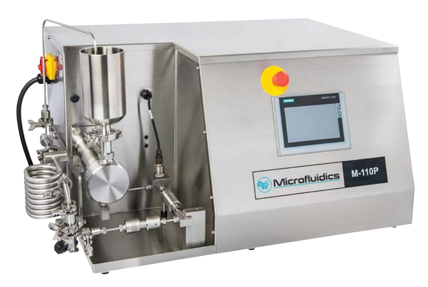
Model shown is subject to change depending on options selected.